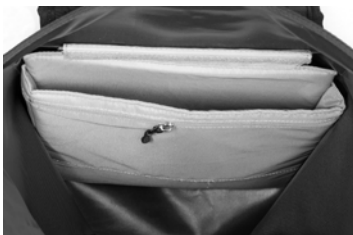
Inner pocket for laptops