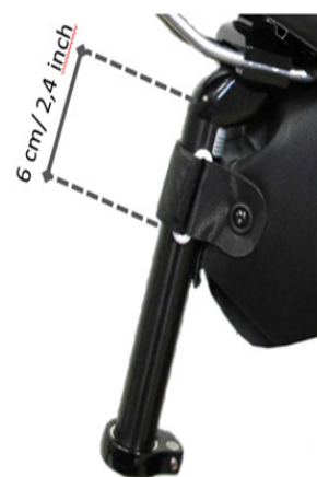
Space required for mounting Seat-Pack 11 L to the seat post