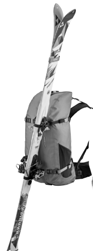
Application example: Attachment Kit for Gear (diagonal ski carrying)