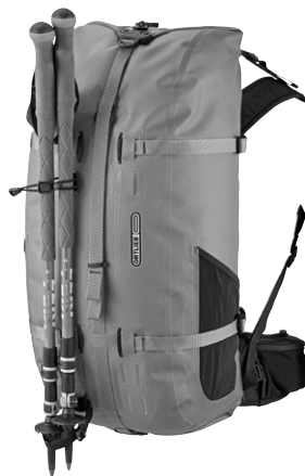
Application example: Attachment Kit for Gear (mounting trekking poles)