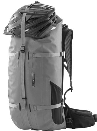
Application example: Attachment Kit for Helmets (helmet toggle for fixing helmets with larger ventilation slots)