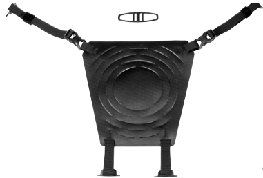
Attachment Kit for Helmets