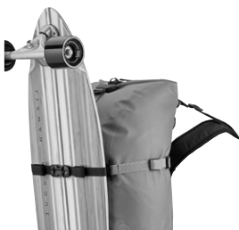
Application example: Attachment Kit for Gear