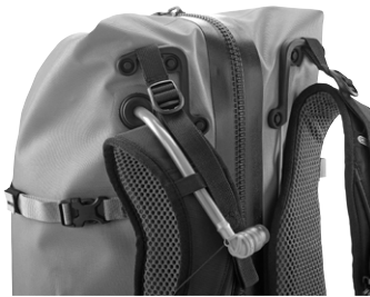
Waterproof hydration tube port