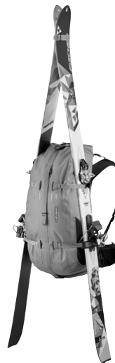
Application example: Attachment Kit for Gear (A-frame ski carrying)