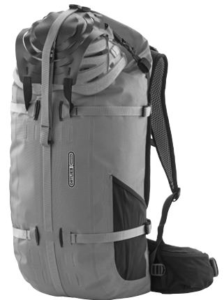
Application example: Attachment Kit for Helmets (universal mounting for various helmets and gear)