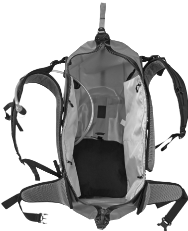
Application example: Hydration System